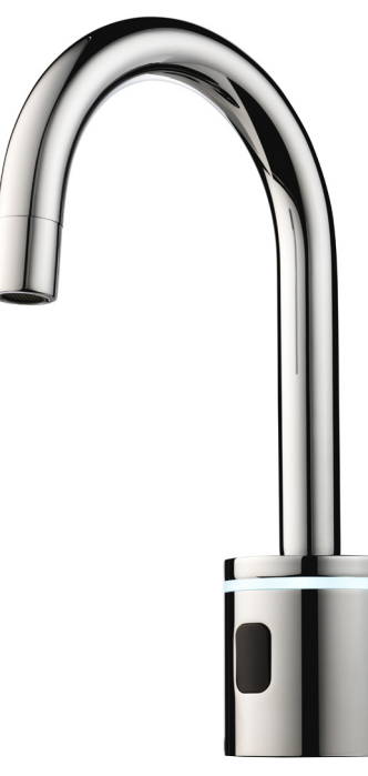
Order Code: 100-0108