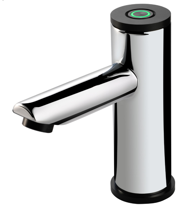
Order Code: 100-0183